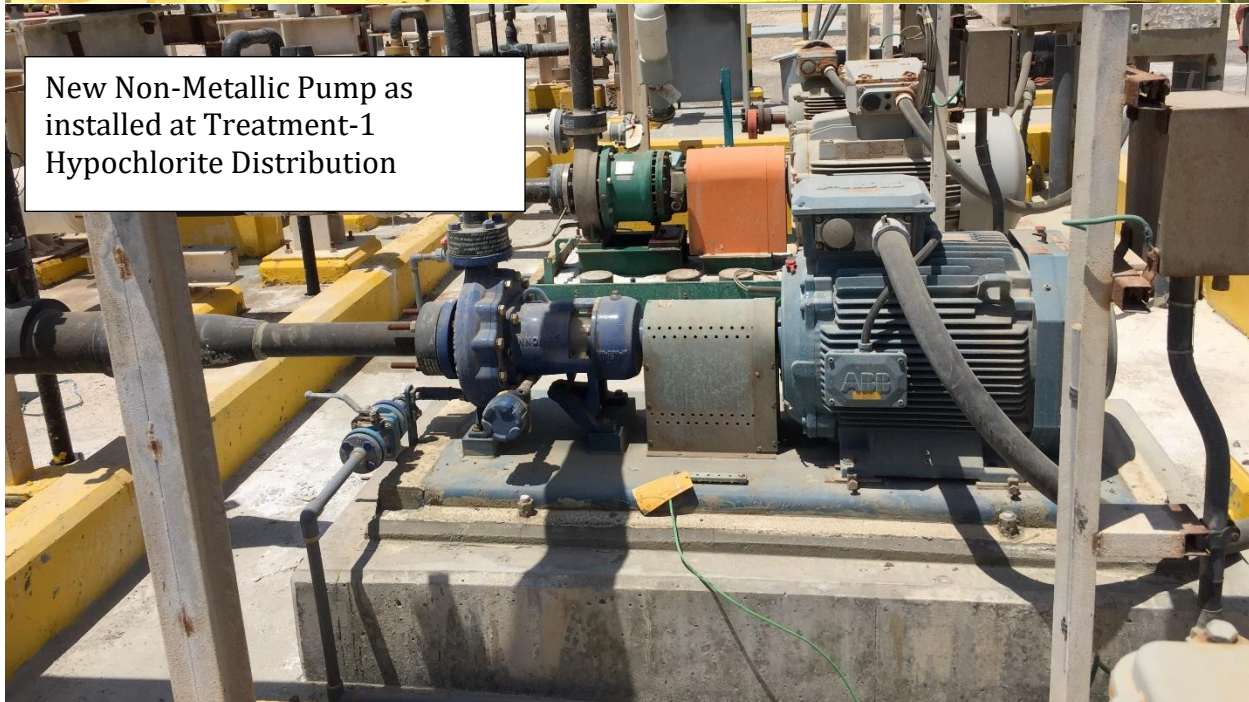
New Non-Metallic Pump as installed at Treatment-1 Hypochlorite Distribution